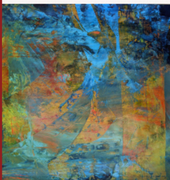
Sacred Story by Eleanor Palmer